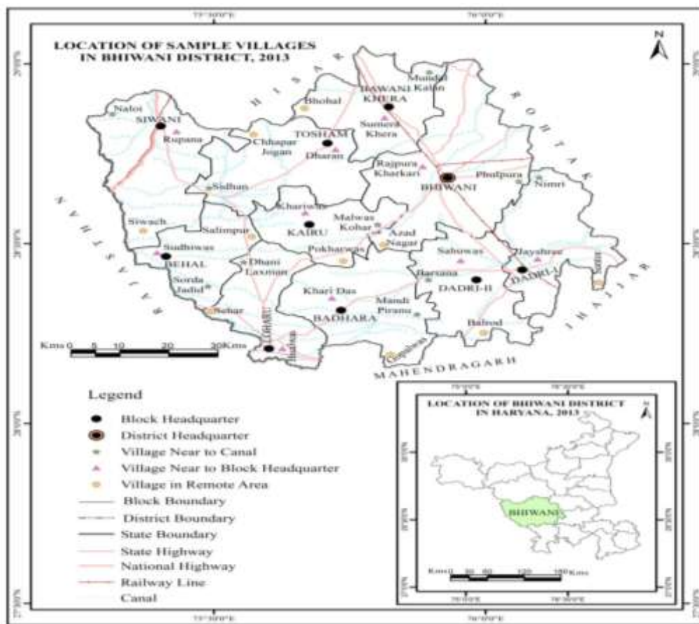
Fig-1: Bhiwani district of Haryana

Then, the energy input and output ratio has been worked out for each selected sample crop by dividing the total energy used by a sample crop by total crop output of the same crop. Further, total energy use and total agricultural productivity of the district have been calculated by adding of the total average energy used of each sample crop and adding of the total average crop output of each sample crop respectively. Finally, the correlation between total energy use and total agricultural productivity has been calculated by using the Karl Pearson's formula: