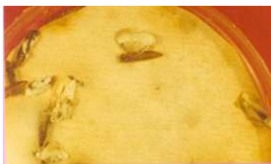
Fig-4: Infection symptoms on SSB pupae induced by the B. bassiana isolate Mcb18

respectively (Table 5). Slopes of the regression equation ranged from 2.94 to 12.54, from 8.41 to 21.96 and from 3.33 to 12.19 for B. bassiana Mcb18, B. bassiana Msb18 and M. anisopliae Mcm1 concentrations, respectively (Fig. 4 and Table 5).