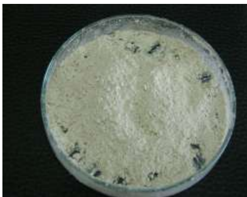
Fig-1: Culture of Beauveria bassiana native isolate Mcb18 grown on Sabouraud Dextrose Agar yeast (SDAY) medium

The virulence of three isolates of B. bassiana and M. anisopliae to eggs, larvae and pupae of the striped rice stem borer, C. suppressalis , were tested in the first screening. Fungi were grown for 3 weeks at 25\pm 2^\circ\text{C} on Sabouraud Dextrose Agar (SDAY) (40g dextrose, 10 g peptone, 15g agar, 10g yeast extract, 0.3g streptomycin) in Difco 1000 ml of distilled water under room controlled conditions ( 25\pm 1^\circ\text{C} , 75\pm 5\% RH) and a photoperiod of 14:10 | L:D | h. Conidia were harvested by surface scraping 21 day-old culture plates (Fig. 1).