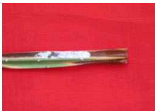
Fig-2: Infection symptoms on an SSB egg induced by the B. bassiana isolate Mcb18

*Three replicates/treatments of 150 eggs, 30 larvae and pupae of insect.