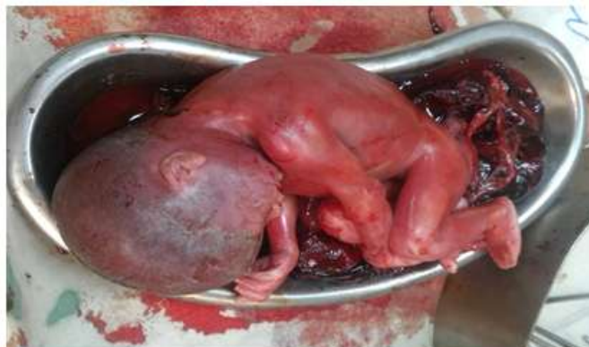
Fig-1(a): Dead fetus of about 22 weeks with placenta