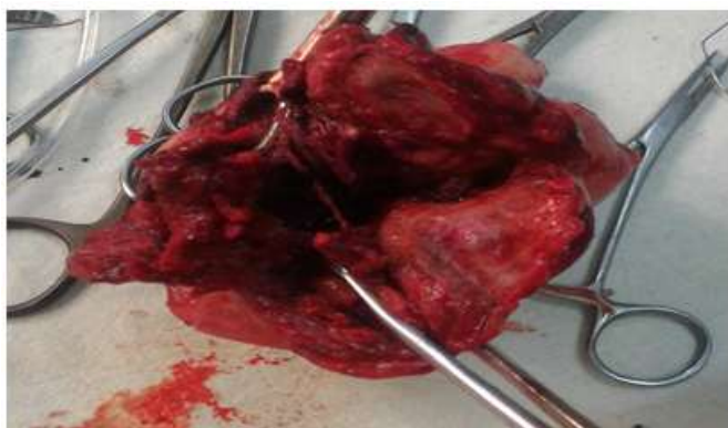
Fig-1(c): uterus after removal, it was so badly ruptured that could not be preserved.