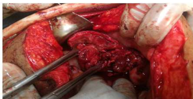
Fig-1(b): Rupture of fundus and lateral wall of the uterus